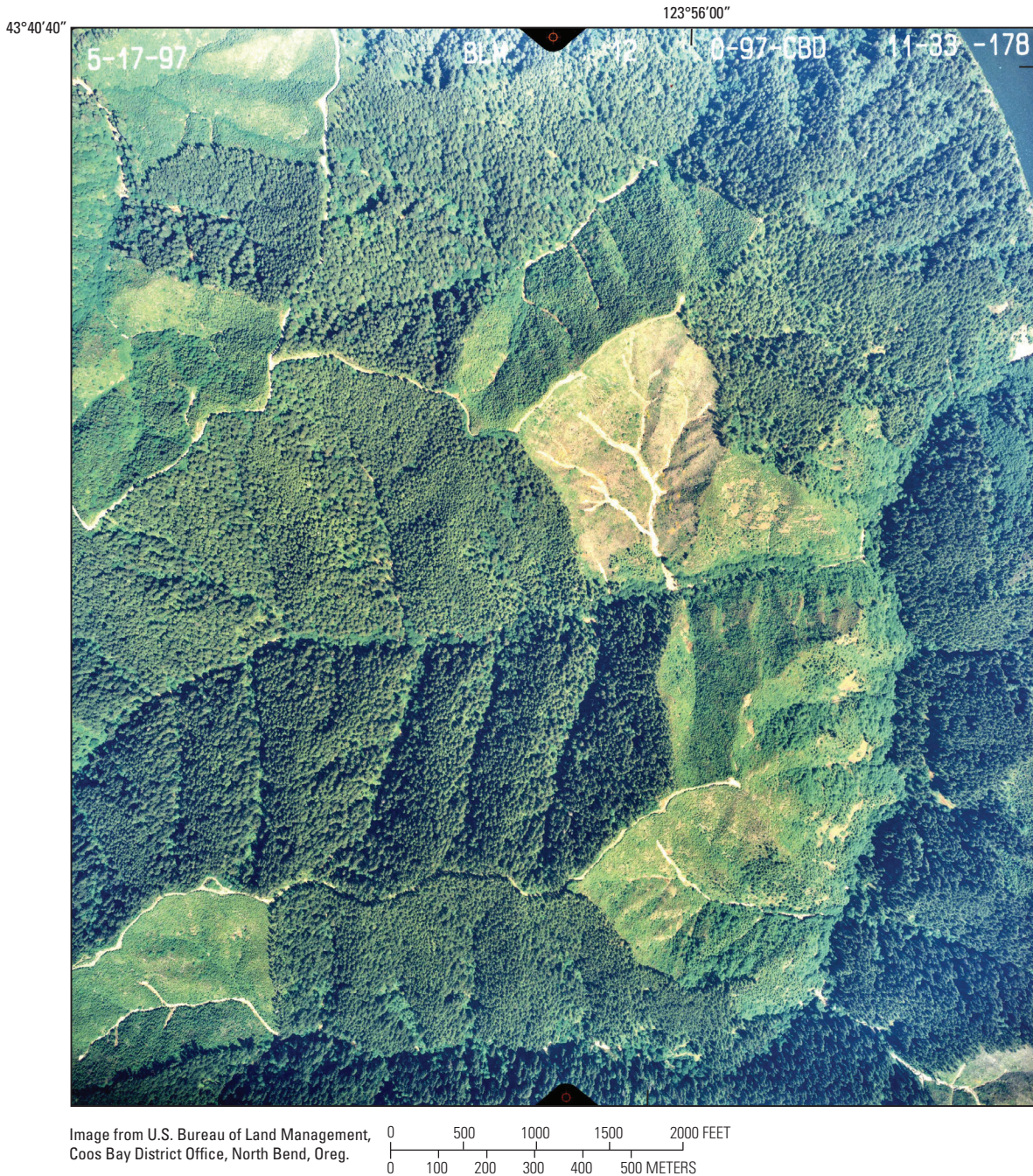
Figure 3. Example of a 1:12,000-scale aerial photograph used for mapping. Area covered by the photograph is shown on map.

the 155 discrete slide source areas mapped, the minimum, maximum, and mean sizes were 17 m 2 , 1,685 m 2 , and 370 m 2 , respectively. Thus far, the map data have been used for evaluating predictions of debris-flow source areas (Baum and others, 2011), developing models for estimating debris-flow travel distances (Coe and others, 2011), and for estimating volumes of sediment eroded and entrained into debris flows for accurate predictions of debris-flow volumes expected in channels and at the mouths of drainage basins (Coe and Michael, 2009).